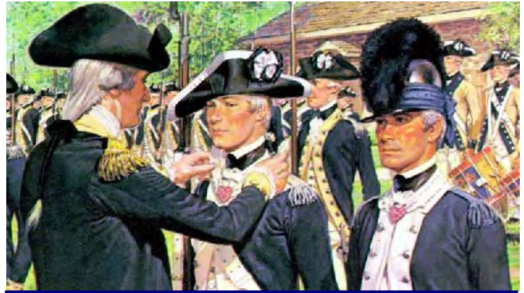
Washington Presenting First Military Badges of Merit to Churchill & Brown